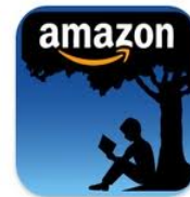
Android, Blackberry, iPad, iPhone, iPodtouch, Windows Phone 7